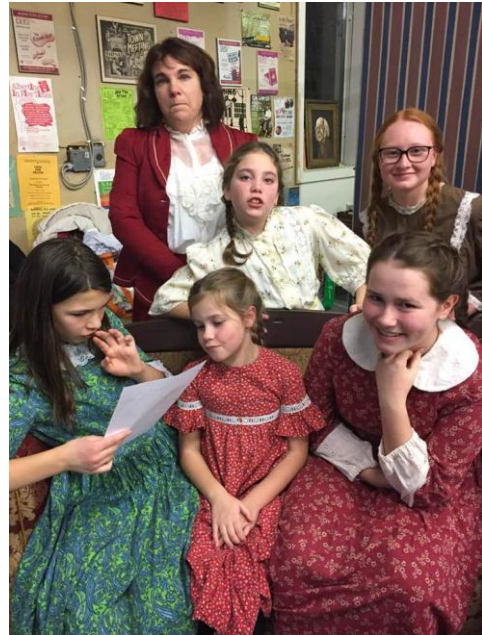
Costumes for Anne of Green Gables