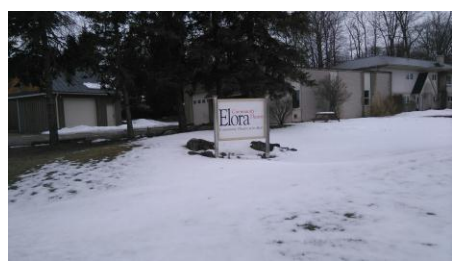
Current Workshop-West Montrose