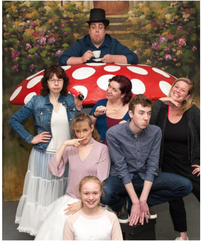
on stage...only these creative people are at work in our ECT workshop providing the beautiful set and set pieces for the play. (See profile for the month.)