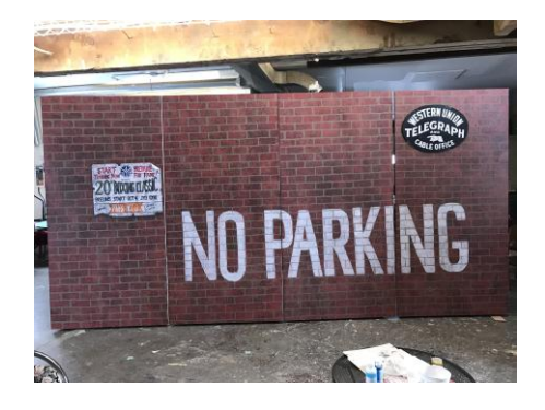
The Sting -Periaktons