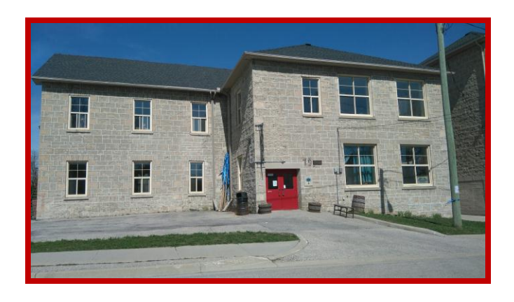
Home before that.....How many of you rehearsed in this building?

Did you know that in 2003 ECT began using this building which was formerly a school (big clue)? We stayed for a year because of rising rent. We went elsewhere for 8 years. (You will see 'elsewhere' in the next May Newsletter.)