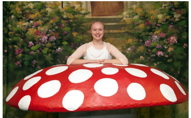
Continue reading on in this newsletter to the profile section for this month and more will be revealed about the talent that you will see

ECT also is proud to have Price Team Dominion Lending Centres as the sponsors for our show: "Alice in Wonderland"