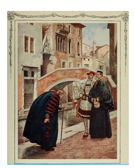
MERCHANT OF VENICE