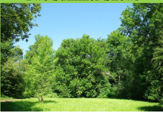
6th season! ECT Shakespeare in the Park 2019!