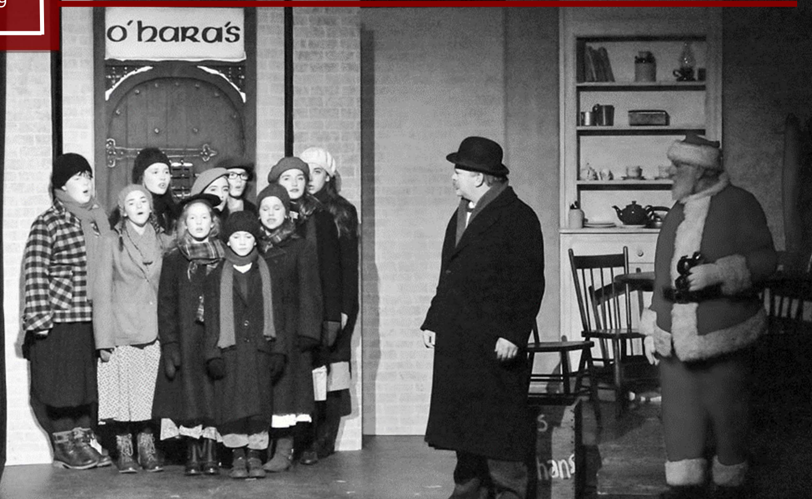
Yes Virginia, There is a Santa Clause – December 2019